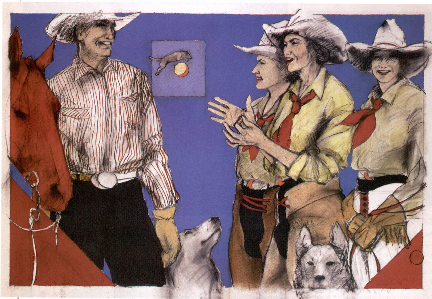
▲ AND THE DOG JUMPED OVER THE MOON, MIXED MEDIA, 40 X 60.

catching up with artists we've featured over the years