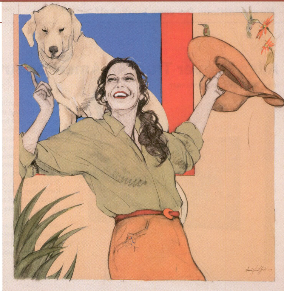
▲ A LITTLE TOUCH OF MAGIC, ACRYLIC, 36 X 36.

What are you working on now? I am working on a short series—six small sketches for bigger pieces. The series is called A Walk in the Woods . It's loosely about being on your own path and the areas that you go through that are fraught with danger. One piece shows some coyotes that are trailing on the heels of a walking woman. Then there is one where