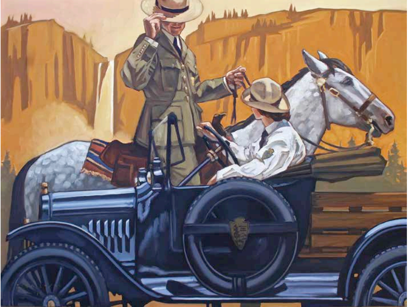
By a Waterfall, National Park Service, 1916, oil on canvas, 36 x 48"

been able to spend time exploring these parks and painting them. The stunning beauty, history and wildlife provide an unlimited source of inspiration and subject matter for my paintings."