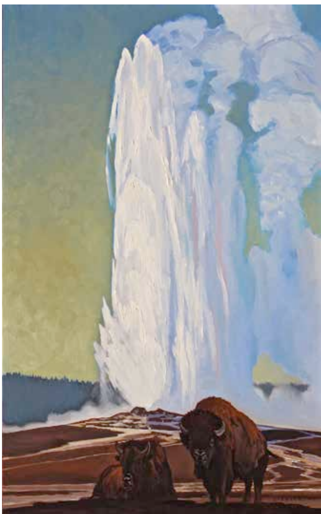
Old Faithful Geyser, Yellowstone National Park, oil on canvas, 48 x 30"

a recent visit to Yellowstone National Park, I became aware of the 100-year anniversary of the National Park Service. I decided I wanted to honor our national parks with a series of paintings depicting some of my favorite places," says the California-based artist. "I feel that the establishment of the National Park system was one of the wisest and most enduring acts of our country. During the last few years, I have