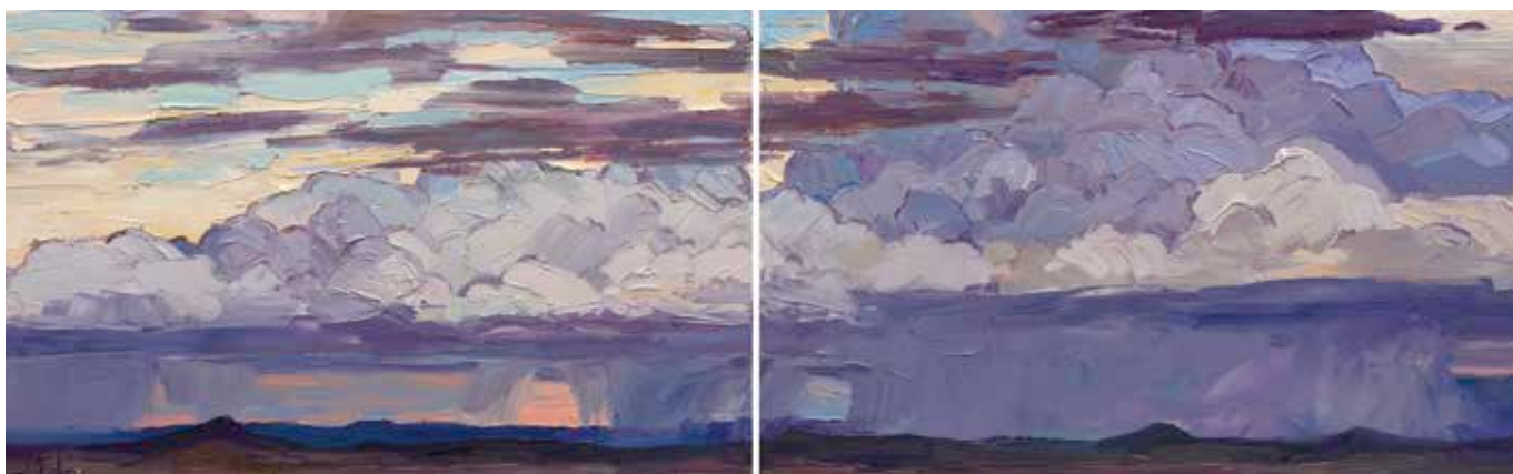
Evening Swell (diptych), oil, 20 x 64"