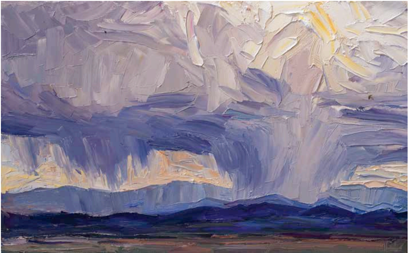
Storm South of Santa Fe , oil, 18 x 29"

the grander scale, measuring 20 by 64 inches across two panels. "That piece I painted just around the corner from where my wife and I currently live in Santa Fe, looking mostly west from outside of Santa Fe across the basin," says Lee. "There was a big line of storms, a big complex that developed late in the day, with the sun hiding behind the clouds and the eye was in the shadow of the clouds. It has the sense of moments of light peeking down on the