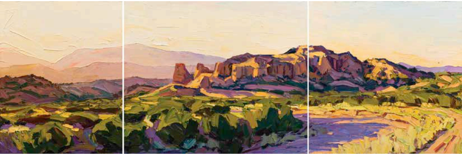
On the Road to Chimayo (triptych), oil, 30 x 90"